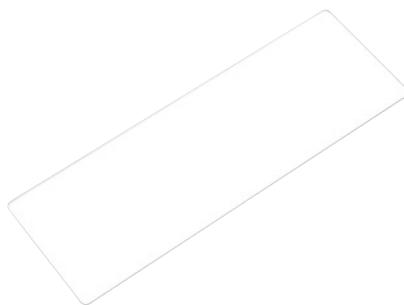
12" CUTTING MAT REV-12-CUT-MAT ○ $14.99