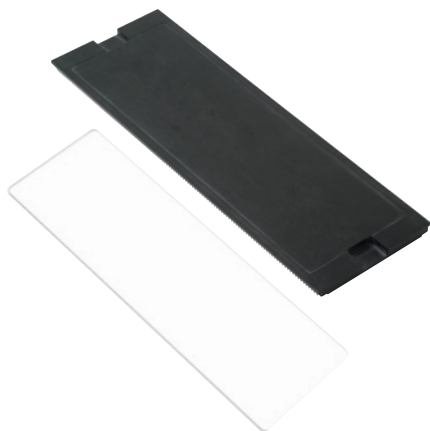
12" PLATFORM SET REV-12-PLATFORM ○ $39.99